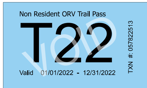
Nonresident ORV Trail Pass