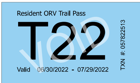
Resident ORV Trail Pass