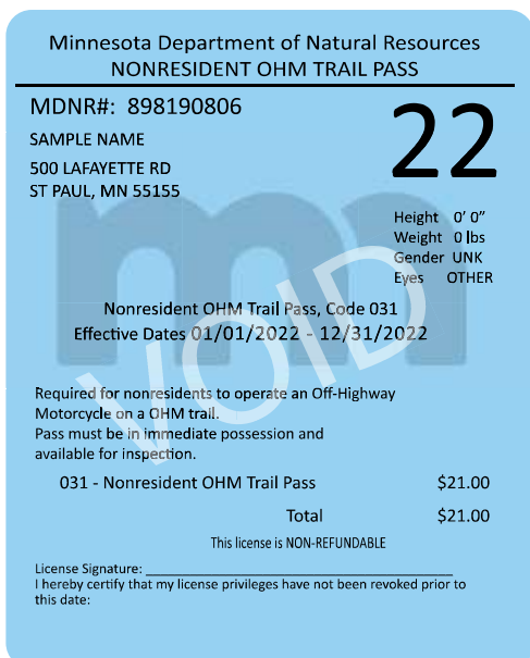
Nonresident OHM Trail Pass